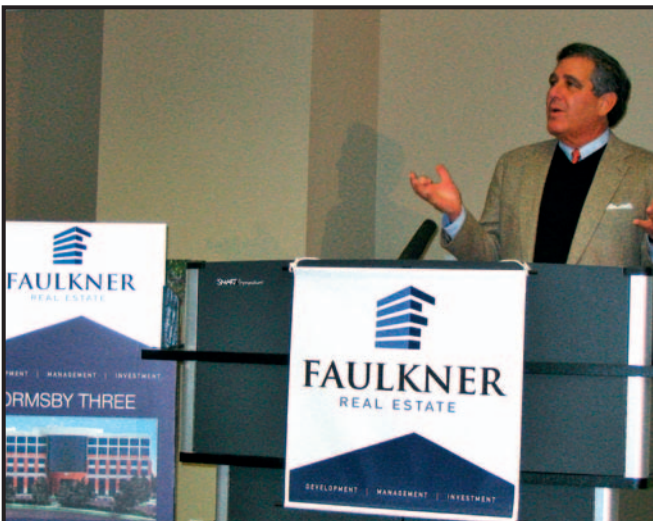
Louisville Metro Mayor Jerry Abramson speaks at the January announcement of Faulkner Real Estate's construction of Ormsby Three, a $25 million office complex at North Hurstborne Parkway and Dorsey Lane in Louisville. The six-story, 150,000-square-foot building is scheduled to be completed in January 2007.