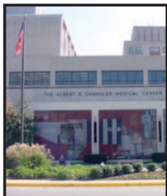
UK Chandler Medical Center