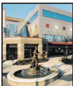
King's Daughter Medical Center