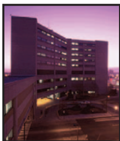
University of Louisville Hospital